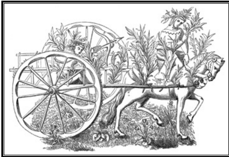
This showeth the taking of a Cart to allure Beasts